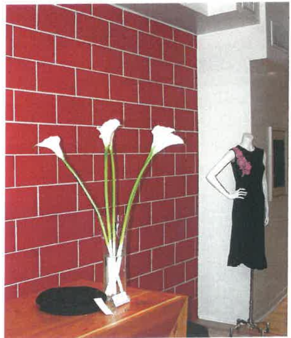
All images shown are Astra-Glaze Sw+®