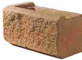
AB CORNER 6°

Weight: 62# each Face Size: 8" x 15.625"