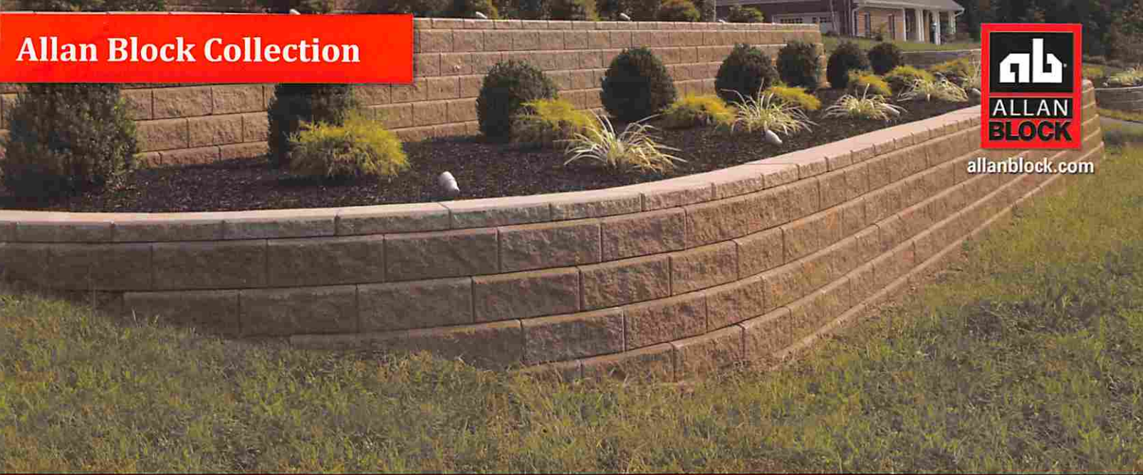
AB CLASSIC 6°