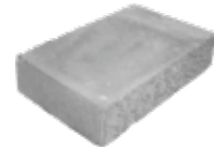
4" Hard-Split Cap 4 x 15 \frac{1}{8} x 9 \frac{3}{8}