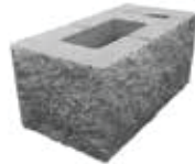
Hard-Split Corner 8 x 18 x 9