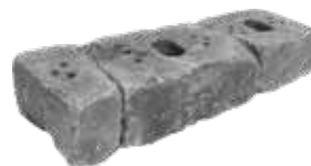
Stonegate Set of 3

6 x 4-6 x 10 | 6 x 10-12 x 10 | 6 x 14-16 x 10