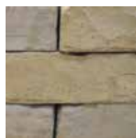
FOND DU LAC